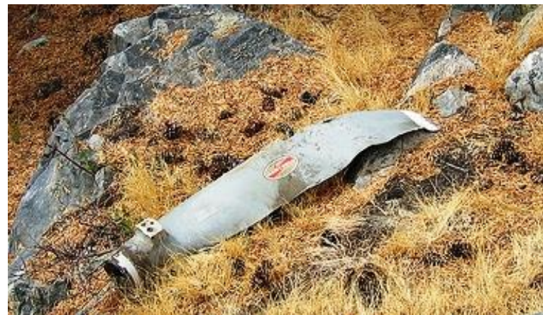
Half of prop