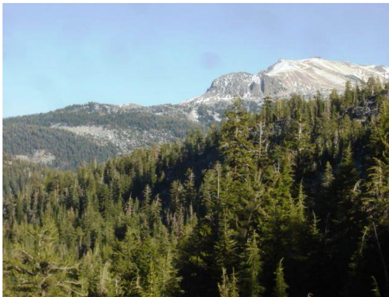
Mammoth Lakes ski area from the wreck site